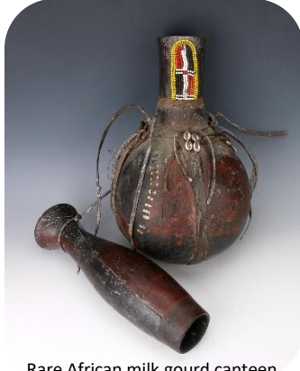
Rare African milk gourd canteen