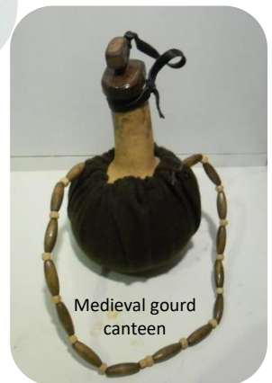
Medieval gourd canteen