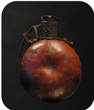
Cameroon calabash canteen