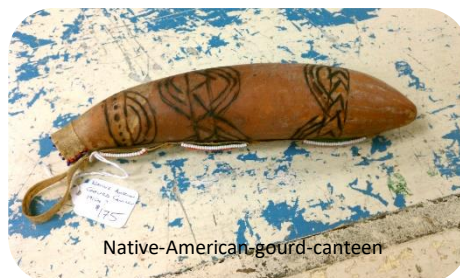
Native-American gourd canteen