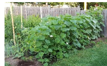
Dorothy – x-lg tomato cages support 8 plants 14 plants in this year. 3 different kinds

November harvest left out all winter on palettes Lost 1 plant to the wind storm