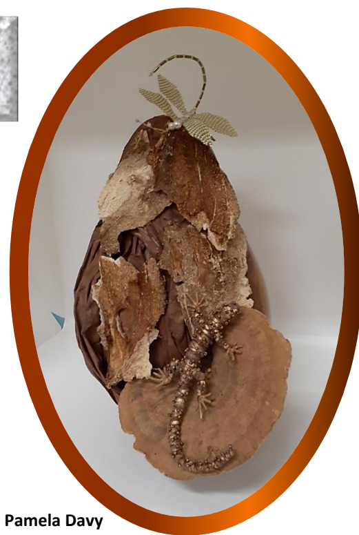
Pamela Davy 'Decoupage Bark'