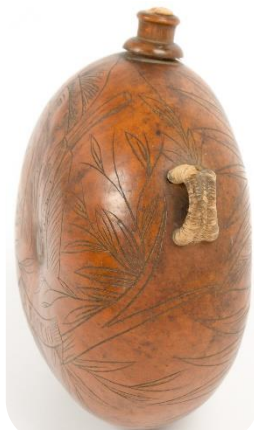
Corsican gourd canteen