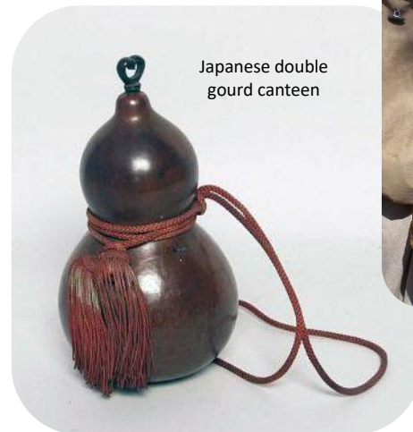
Japanese double gourd canteen