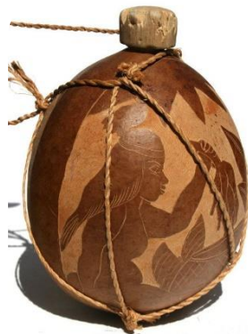
American Indian gourd canteen