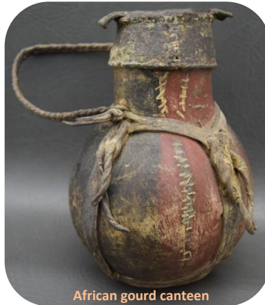
African gourd canteen