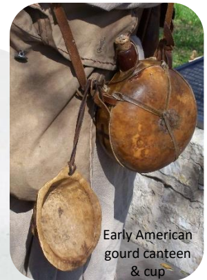
Early American gourd canteen & cup