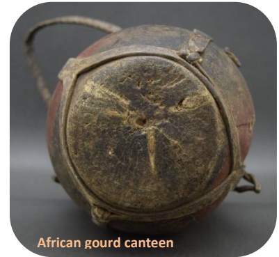
African gourd canteen