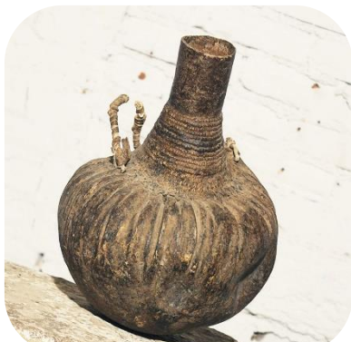
African Calabash gourd water milk canteen