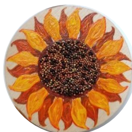
Barbara Bellchambers 'Sunflower pin'