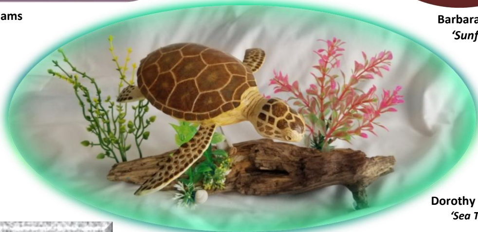
Dorothy Hawkins 'Sea Turtle'