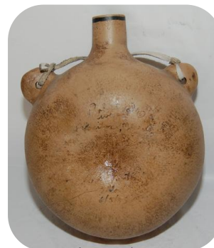
Apache gourd canteen