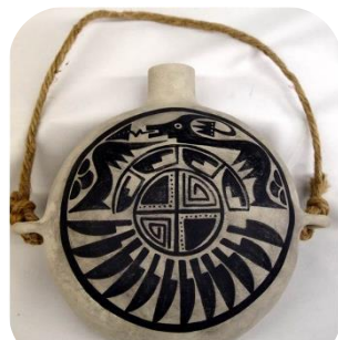
Southwest style painted gourd canteen